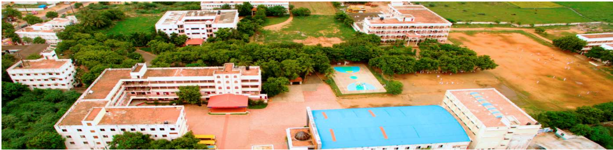
Fig -1:FX Engineering College