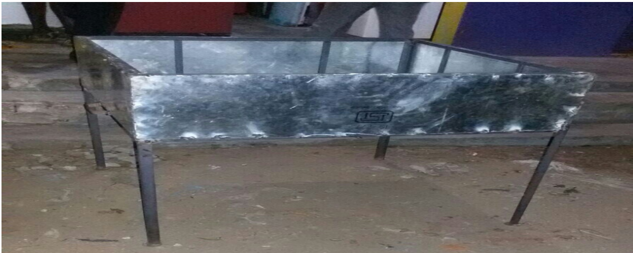
Fig mild steel with two flate plate collector

The mild still angle are L-shaped structural steel represented by dimension of sides & thickness. For e.g. 50cmx50cmx6cm means, both the sides of angles are 50mm & thickness is of 6mm. This is welded by filler rod into dimensions of (0.9m x 0.9m x 0.3m) in a rectangular shape. It is connected by stand like material. The stainless still are used cover material which can stand heavy load such as pebbles, red stone with any error. The welding process is used to join the material into respective shape. Carbon steel is steel in which the main interstitial alloying constituent is carbon in the range of 0.12-2.0%. The American Iron and Steel Institute (AISI).