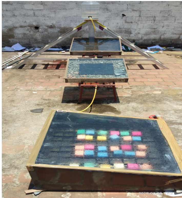
Fig -1 Schematic diagram of Experimental setup