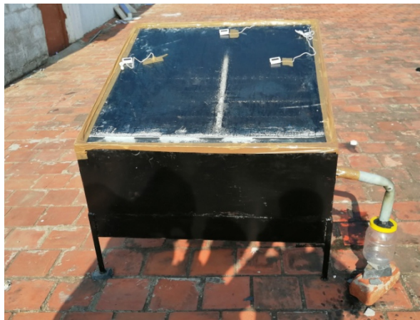
Fig.2. Experimental set up of stepped basin solar still

The single basin solar still has effective basin area of 1m x 1m and fabricated out of stainless steel material. The bottom of the still painted with black by mixing a special black dye with resin. A window glass of 3 mm thickness inclined at inclined at 30 0 if fixed to the vertical wall of the still. To ensure that vapors are not lost atmosphere, the glass cover sealed with the rubber gasket. An inlet pipe provided at the rear wall of the still for feeding water.