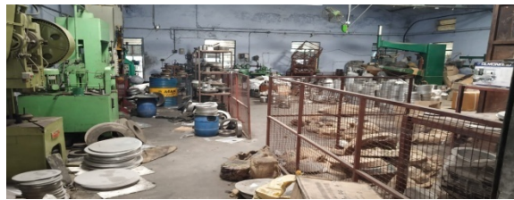
Photographic view of machine shop

Apple cooker industry is one of the leading manufacturing of cooker in Tamil Nadu. It was established in December 2015. Moreover, there are several products manufactured such as Pressure cookware, stainless steel cookware, Non-stick cookware etc. These products are exported across the countries. The main raw materials used are Aluminum, stainless steel etc. These are around 500-600 products are being manufactured per day. These products are exported to various countries and still expanding its growth towards excellence.