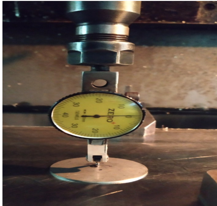
Fig -3: Measurement of bowl height