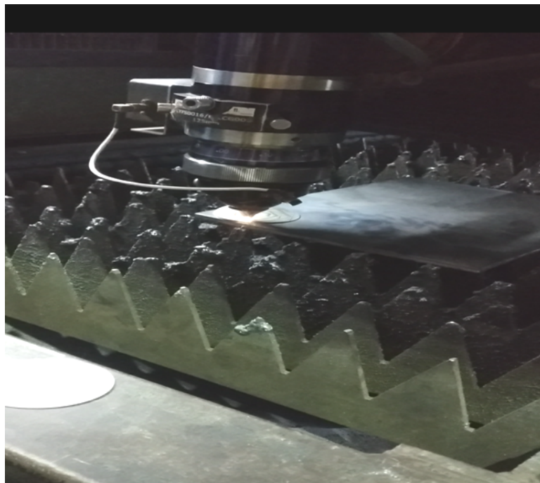
Fig -2: Experimental set up

The experimental work has been carried out on fiber optic laser machine. The scanning pattern is drawn in the AUTOCAD. The specimen is held on the work table the laser beam is moved as per scanning pattern on the work piece and due to the stresses generated in material the deformation is occurred. Similarly for different combination of parameters the experiments were performed. The fig-2 shows the experimental set up.