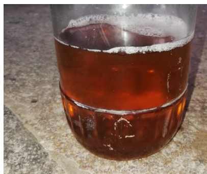
SAMPLE OF BIO DIESEL Fig 2