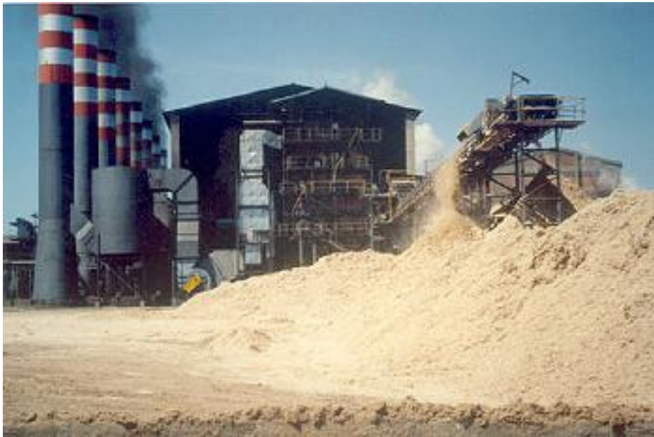
Figure 2. The Usina Santa Elisa sugar mill in Sertãozinho, Brazil. Bagasse, a by-product of sugar production, can be burned for energy or made into ethanol.

Bagasse (see Figure 7.6) can have other uses. The composition of bagasse is: 1) cellulose, 45-55%, 2) hemicellulose, 20-25%, 3) lignin, 18-24%, 4) minerals, 1-4%, and 5) waxes, < 1%. With the cellulose content, it can be used to produce paper and biodegradable paper products. It is typically carted on small trucks that look like they have “hair” growing out of them.