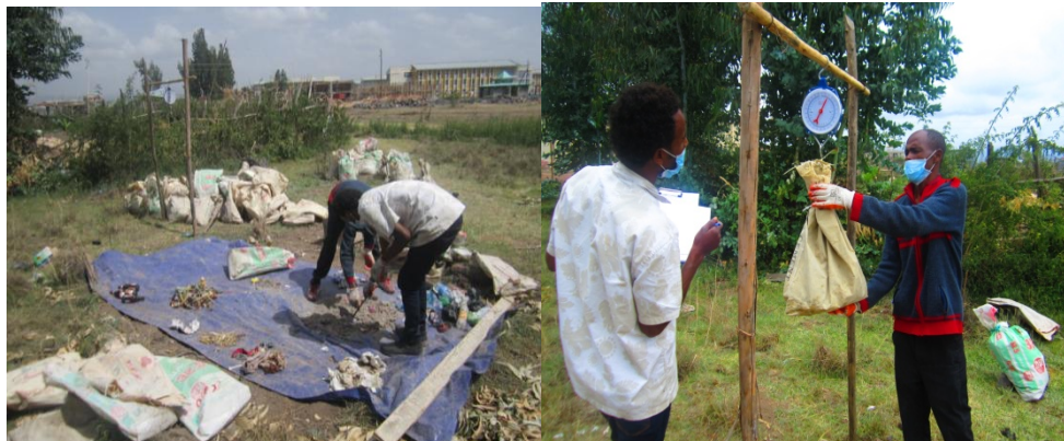
Plate 1. Sorting and weighing of municipal solid waste

The above plate (1) shows sorting and weighing of MSW. At the designated sorting place, SW collected from different groups was spread on the plastic sheet placed on a level ground surface for sorting purpose. The waste was sorted into different type of components. The sorted components include: food wastes, paper & cardboard & plastics, water bottles, textiles, rubber & leather, garden trimmings/yard waste, wood, glass, metals & tin cans, ashes/dirt/bricks, diaper, bones. The sorted wastes were weighed using scales of capacity 20 kg. The volumes of individual components were recorded using wooden box of known volume.