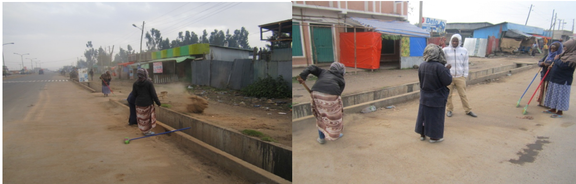
Plate 3: Researcher discussing & collecting information with street sweepers.

Street sweeping activity was included in the MSWM (plate 3). The town has 7Km of road from Madda Walabu University to Technic. Three street sweeping groups in the town consisting of 35 members, take care of this activity. Except Sunday, they sweep the roads remaining days (Monday to Saturday). Regular cleaning was required to remove solid wastes like animal waste, paper and plastic waste, remains of chat and fruits, dust entering the asphalt roads from adjacent mud roads. The sweepers use brooms for street cleaning and they work in the early morning hours. The street sweepings excluding dust (i.e. Mud) was temporarily stored in small heaps along road sides and transported to disposal site using three donkey carts( gari ) twice a week i.e. on Monday and Wednesday. It was observed during the study period; sweepers will throw the dust to the footpath area (plate 3). The samples were collected from five different places, considering stretch of 10 meter per sample. The weights recorded from sampling point 1 to sampling point 5 were: 0.7 kg, 0.4kg, 0.9kg, 1.1kg and 0.6 kg. For one kilometer road stretch, the total amount of waste generation was 0.074 t.