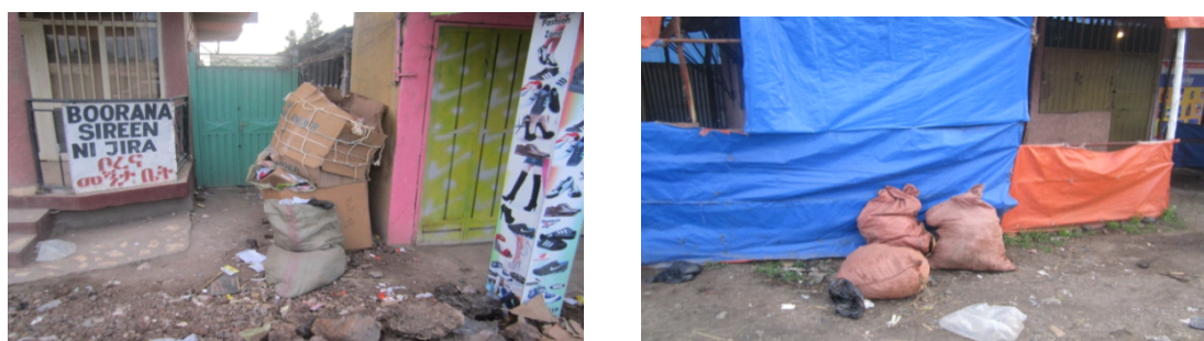
Plate 4: Storage of commercial waste before disposal

Commercial and institution wastes were produced from business areas such as offices, shops, restaurants, hotels, banks, educational institutions etc, composition of residential and commercial wastes were almost similar but percentage varies. For the determination of quantity of SW, the sample size was fixed as 15 from 3 kebele at the rate of 5 samples from each kebele.