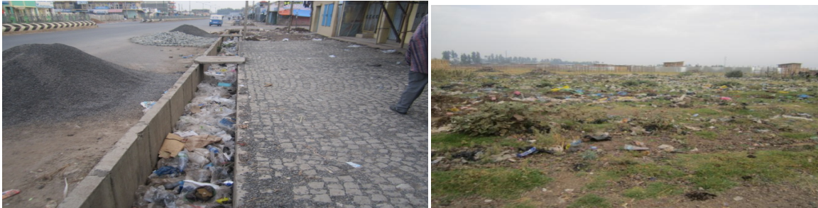
Plate 2: Indiscriminate disposal of SW in an open drain & scattering of plastic waste in an open area.

Diapers were present in the domestic wastes of middle and high income groups; it's contribution was 2.96 % by weight and 1.76 % by volume. Nowadays, parents started using disposable diapers for children's feces, a common practice in many economically stable families. Improvement of economic conditions in future increases the % of diaper in waste composition. The rubber and leather waste % by weight and volume was 2.45 and 1.6 respectively. The worn-out slippers, shoes, belt etc contribute to this waste. The paper & cardboard waste amounts to 2.5% by weight and 4.73% by volume. The contribution of textile in the form of pieces of torn cloth/rags in the waste stream was 2.38% by weight and 4.08% by volume. The least % of wastes in terms of % of weight and % volume were metal waste, wood and bone pieces. They were present in the order 1.28%, 0.77% & 0.13% by weight and 0.45%, 0.34% & 0.075% by volume respectively. The waste components which have resale value in the market such as metal waste, jerry cans, bottles etc, minimize the quantity of SW to some extent and appear less in the waste stream.