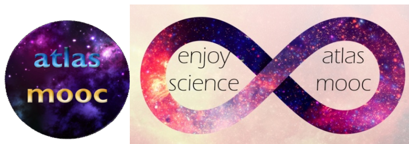
Figure 2: Channel art and icon of ALTAS MOOC. We developed channel art and icon (profile) as well as an intro video layout with an alive, elegant, funny and entertaining appearance to attract YouTube viewers.