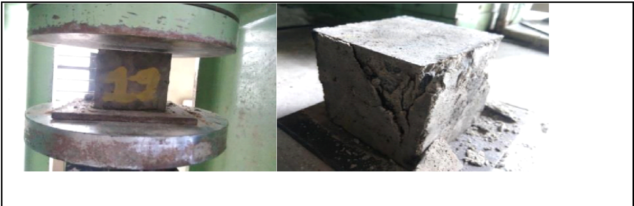
Failure Pattern of Specimen Test