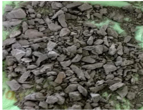
Pulverized Artificial Aggregate