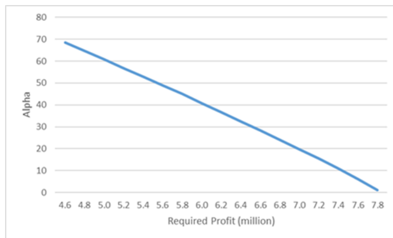
Figure (2) Relationship between required profit and maximum \alpha

more conservative. As discussed in the previous section, the variability and magnitude of the regret generates this conservative approach within RDM. Since RDM is pursuing to minimize regret, RDM puts extra weight on bad outcomes and is more sensitive to really bad outcomes. EU attempts to find the optimal alternative, but RDM is suitable when optimality is less important and possible bad outcomes have severe consequences.