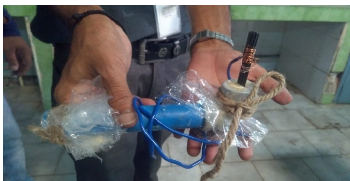
Figure 1. Candle wax-salt bridge.

Materials required for the construction of candle wax-salt bridge are water, candle wax and common salt.162.5 ml of water is boiled in a clean beaker, 16.25gm of candle wax and 18.75gm of common salt are slowly added to the boiling water, the whole mixture is further boiled for 4-5 minutes. Mixture is poured into open end of PVC pipe, other end of pipe is kept closed by using plastic wrap, after pouring the mixture into PVC pipe, pencil leads are placed in a mixture, whole set up is allowed to solidifies and is kept 24 hours in refrigerator. Length and diameter of the salt-bridge are 110mm, 32mm, figure 1 shows Candle wax-salt bridge..