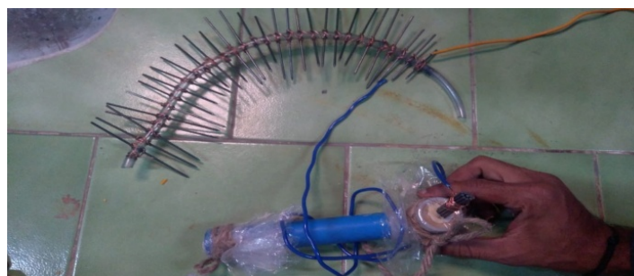
Figure 2. Arrangements of electrode materials