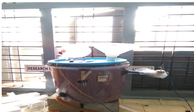
Figure 3. Experimental model of MFC

A 25 liter capacity of Single chambered microbial fuel cell with candle wax salt bridge is constructed for the treatment of domestic (kitchen) wastewater and generation of electricity. The electrodes were placed into the anode chambers and cathodes, at the centre of reactors a circular groove was made for fitting the candle wax-salt bridge, salt bridge is used to enhance the maximum power output, In this reactor sampling ports are provided at top and bottom to study the characteristics of wastewater, then the whole set up is sealed and made air tight, after fabrication work is completed reactor is checked for water leakage, figure 3 shows experimental model of MFC.