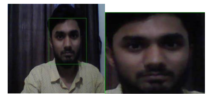
Fig. 2 Face detection result (a) face detection with bounded box and (b) face cropped region