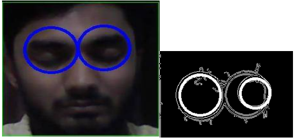
Fig. 5 Closed Eye detection result (a) Closed eye detection with circular bounded box and (b) retinadetection

After finding the consecutive frames if closed eye result displayed, then it will generate the alarm signal to wake up user/driver.