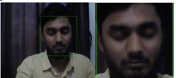
Fig. 4 Face detection result (a) face detection with bounded box and (b) face cropped region