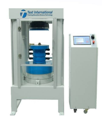
Fig -2: Compressive Testing Machine(CTM)

Visit: <u>www.ijirset.com</u> Vol. 8, Issue 5, May 2019