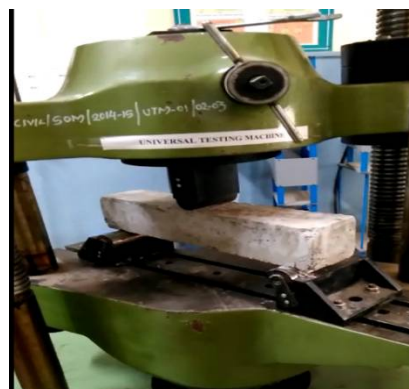
Fig 3.Flexural Testing

Flexural strength, also known as modulus of rupture, bend strength, or fracture strength, a mechanical parameter for brittle material, is defined as a material's ability to resist deformation under load. The flexural strength represents the highest stress experienced within the material at its moment of rupture. The flexural strength (N/mm 2 ) of rectangular cross-section using a three point flexural test technique is obtained by the formula,