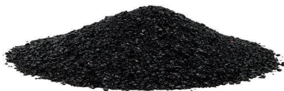
Fig 1. Copper Slag

Copper slag can be used in concrete production as a partial replacement for sand. Copper slag is used as a building material, formed into blocks. Such use was common in areas where smelting was done, including St Helens and Cornwall in England. In Sweden fumed and settled granulated copper slag from the Boliden copper smelter is used as road-construction material. The granulated slag (<3 mm size fraction) has both insulating and drainage properties which are usable to avoid ground frost in winter which in turn prevents pavement cracks. The usage of this slag reduces the usage of primary materials as well as reduces the construction depth which in turn reduces energy demand in building. Due to the same reasons the granulated slag is usable as a filler and insulating material in house foundations in a cold climate. Numerous houses in the same region are built with a slag insulated foundation.