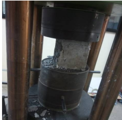
Fig 2.Compressive Testing

Compressive strength is often measured on a universal testing machine. By definition, the ultimate compressive strength of a material is that value of uniaxial compressive stress reached when the material fails completely. The compressive strength (N/mm 2 ) is calculated by using the formula.