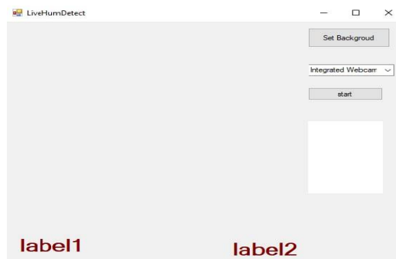
Fig 2:Home page