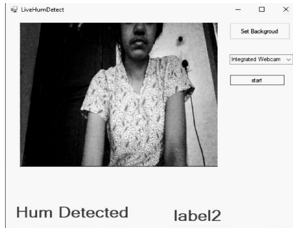
Fig 3:Human detection