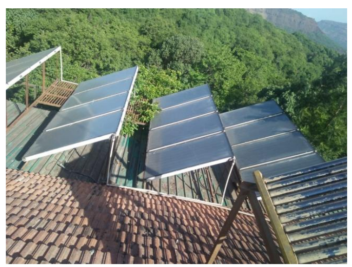
Figure 3. Photovoltaic (Solar) Cells

renewable energy, particularly in homes, offices and industries, for the purpose of lighting, heating and powering of appliances. In most rural and sub-urban regions in Nigeria, inhabitants do not have access to electricity supply. Where the Electrical energy is available, it is not reliable; hence inhabitants resort to other forms of energy such as wood, paraffin, and diesel generators, which pollute the environment and cause harm to man and plants.