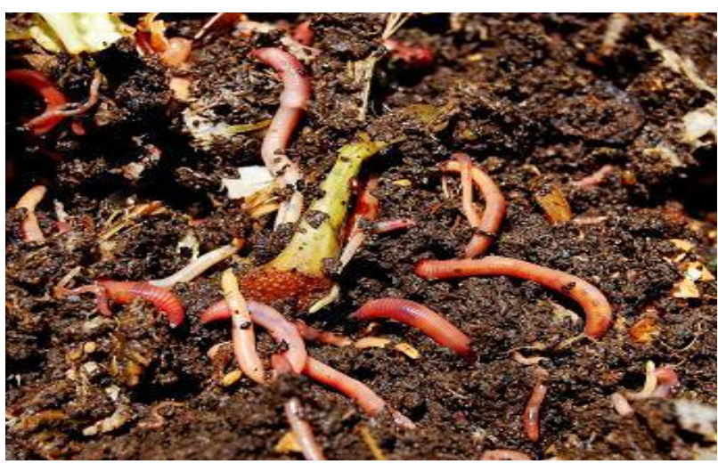
Figure 2: Vermi Composting