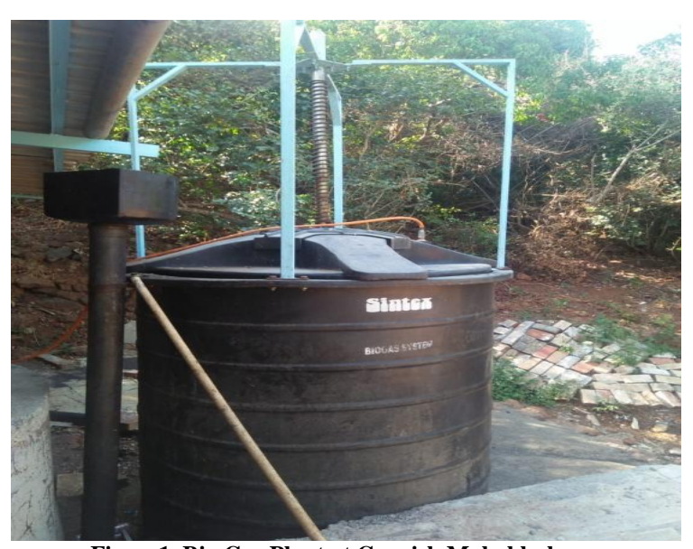
Figure 1. Bio Gas Plant at Gourish Mahableshwar

Table 1. Composite 567890 =- n of biogas.