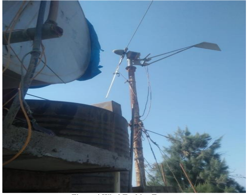
Figure 4.Wind Turbine Energy

increased demand for electricity to provide modern guest comforts and services. The energy management in hotels is the practice of controlling the consumption of electricity required for the delivery of products and services to customers. The power utilization can be lowered by adapting strategies such as change of organizational practice with low or no cost; implementation of energy efficient technologies that require capital investment; and encouraging guest to consume low power in all their activities in hotel building towards supporting the efforts of hotel in minimizing their GHG emissions ( Gourish Mahableshwar ). The energy efficiency is able to elevate the level of service of the hotel by lowering its energy consumption and cost of operation. Small wind energy systems are based on a rotor, a generator or alternator mounted on a frame, a tail (usually), a tower, wiring, and the electrical components: controllers, inverters, and/or batteries.