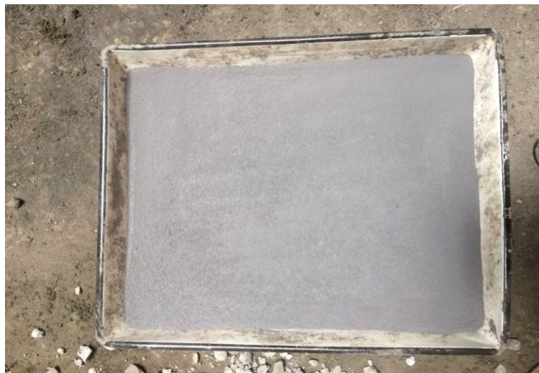
Fig. No. 3.1: Microsilica Supplied by walter pvt.ltd.

The microsilica used in the laboratory is complies with ASTM C1240 as shown in figure no.3.1 was obtained from Walter Pvt.Ltd. Mumbai.