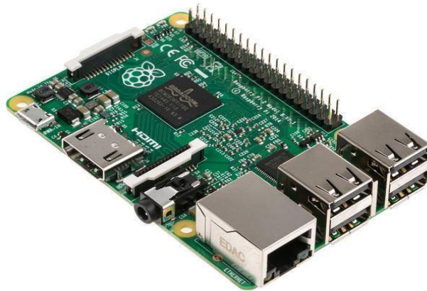
Fig. 3. Raspberry Pi