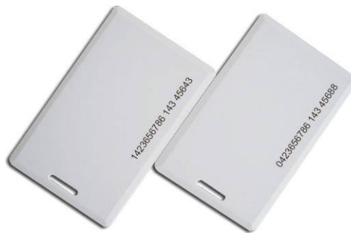
Fig. 1. RFID Tag

A reader consists of a scanner with antennas to transmit and receive signals and is responsible for