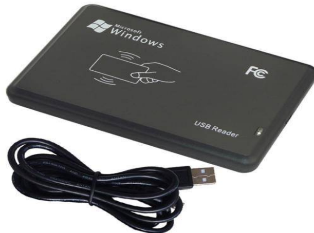
Fig. 2. RFID reader