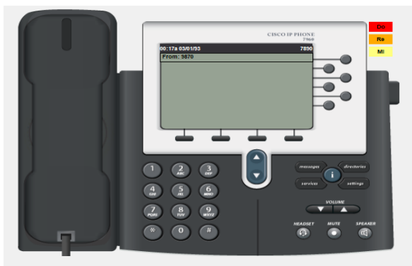
Figure 2 Caller