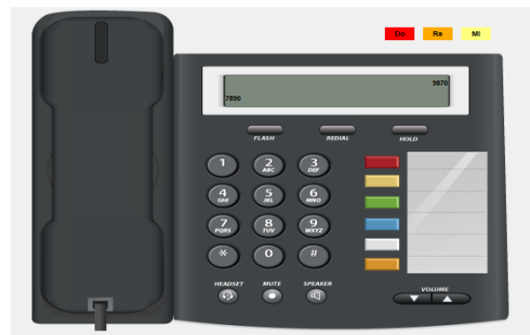
Figure 3 Receiver