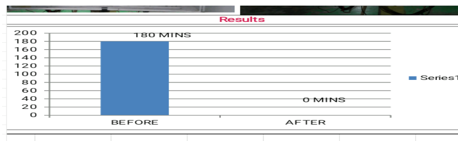
Figure 3.proposed system heater failures

The above graph shows the data for the proposed system heater failures. As we have analysed the process and the design of the heater structure in the existing method the heater failures where up to 180 minutes,so there was a loss in the production and the time to repair was also more and there is also more capital loss then these are used after the production is high.