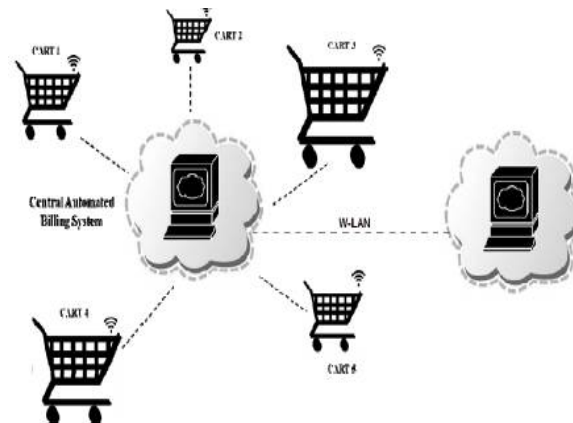
Fig1: Central Automated Billing System product database