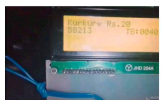
Fig. 3 Scanned product details on LCD

• The data of a scanned product is displayed as follows: