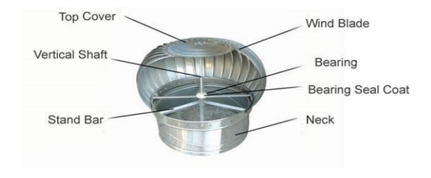
Fig no:3Actual view of Ventilator

For electricity generation purpose dc motor is used. A dc generator is one kind of electrical machine and the main function of this machine is to convert the kinetic energy into DC. The energy alteration process uses the principles of energetically induced electromotive force. Small amounts of energy generated by DC motor depends on speed of rpm.