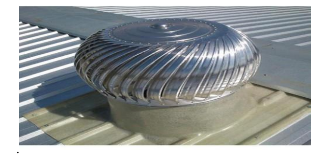
Fig no:2 Roof Top Ventilator

In this paper second type is preferred. Roof ventilator consist of stationary part and rotational part .The stationary part is composed of base and fixed shaft and rotational part is composed of fan blades and bush put on the fixed shaft on stationary part . The construction of roof ventilator shown in following fig 2