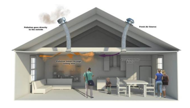
Fig no:1 Hot air extraction-stack effect

The main function of free spinning RTV is to provide fresh air in roo, space and living areas all year around 24 hrs a day free of charge. By using this the better air ventilation is achiev. The main and additional advantage of this project is to produce the electrical energy from the roof ventilator