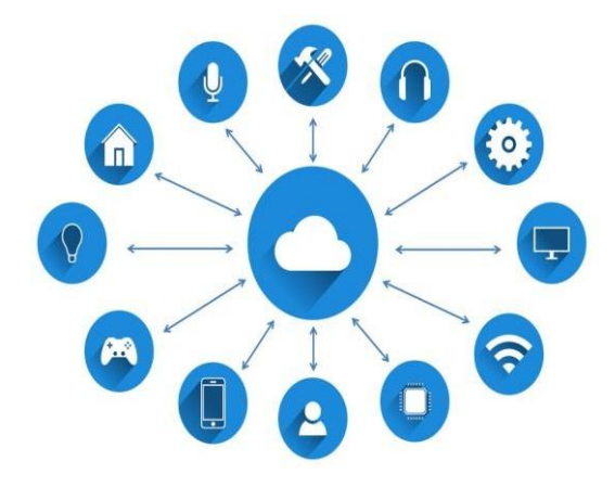
FIG: 1: Cloud Computing

Cloud computing is now the default option for many software's and apps. The main concept of cloud computing is that the location of the services is just irrelevant to the customers who use it they just need the services don't care where is the services being provided from.