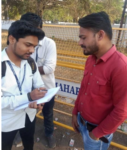
Fig.No.1. In the OD study, the questions were asked to the road users.