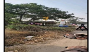
Fig.No.3. The various parameters of road are shown due to it the accidents occur and no safety to the road users.