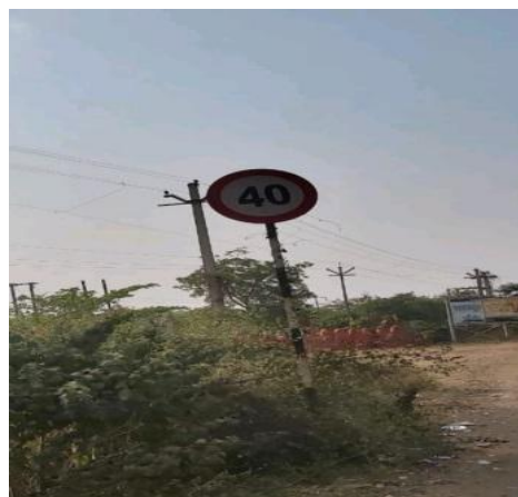
Fig.No.2. The speed limit board i.e., 40 km/h is given for the vehicles on the stretch.

When selecting a location and layout, care must be exercised so that the observer can clearly see any vertical reference posts. The observer should be positioned higher than the study area and be looking down. The position could be on a bridge or a roadway back slope. An accurate sketch of the site should be documented, including number of lanes, position of observer, and description of reference points.