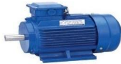
Fig.3 Electric motor