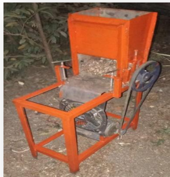
Fig.1 Power operated groundnut Sheller Machine