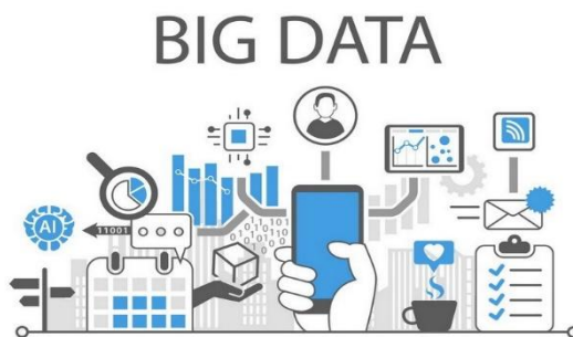
Fig.1 Use of Big Data

In digital era, data is growing at a rapid scale from digital sources which leads to the growth of big data, which is a large collection of data. Big Data is a term which is used to refer to the enormous amount of data that is complex in its own way that the traditional database management systems and software techniques are unable to process it. Big data are also the data sets that are so big and complex that traditional data process or software can't deal or process it. It basically includes those data sets with an extremely large sizes which can be beyond the ability with commonly used software tools can process it.