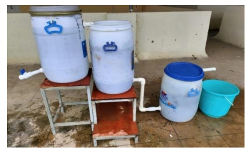
Fig. 1. Filtration treatment unit

Collection of grey water was done from household kitchen appliances in 20 litres capacity buckets. The collected grey water samples were sent to laboratory for testing and studying the initial characteristics of grey water. After studying the initial characteristics, the raw grey water was treated using a filtration treatment unit of 3-barrel system as shown in figure below. The first barrel consists of two screen mesh, screening and floating of suspended materials is carried out in first barrel. After that water was allowed to pass through second barrel which consist of coarse aggregates of size 20 to 10mm. At last water was passed through third barrel consisting of half part of coarse aggregates of size 10 to 4.75 mm and half part of crushed, sieved, washed and dried concrete waste which acts as an alternative to river sand. The sludge valve is also provided for periodic backwashing. The water passed from all three barrels was treated and collected in a storage bucket and further tested before using in making concrete. After treating grey water was tested for its final parameters which were within permissible limits.