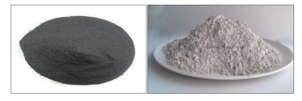
Fig.1. Silica Fume

Silica Fume: It is a by-product of manufacturing silicon metal or ferrosilicon alloys. One of the most advantageous uses for silica fume is in concrete. Because of its physical and chemical properties, it is a very reactive pozzolan. Concrete carrying silica fume can have very high strength and can be very durable. Silica fume contains primarily of amorphous (non-crystalline) silicon dioxide (SiO<sub>2</sub>). Each particles are extremely small, approximately 1/100^{\text{th}} the size of an average cement particle. Due to its fine particles, large surface area, and the high SiO<sub>2</sub> content, silica fume is a very reactive pozzolan when used in concrete.