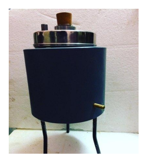
Fig 2: Apparatus used

From the graph we see that biodiesel sample 1 has the lowest pour point and cloud point. A four stroke diesel engine works by intake, compression, power and exhaust. Hence the Biodiesel sample 1 will be most useful for the present study. Various samples of Biodiesel were used with different additives.