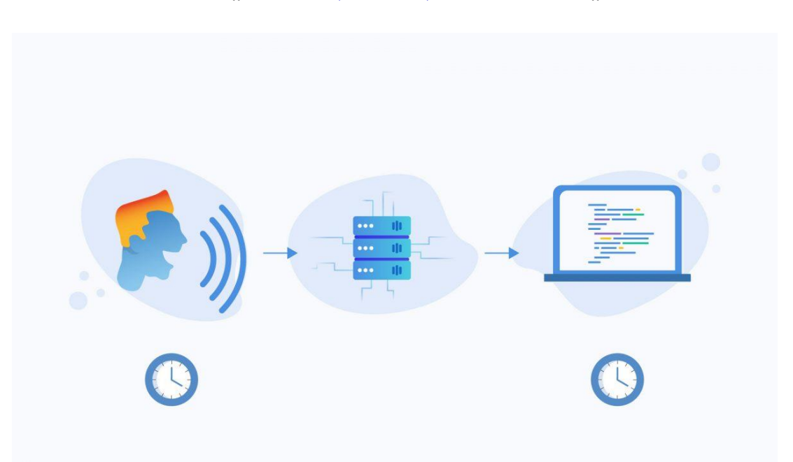
Figure 1. Audio Transcription and Script Generation

The rest of the paper is organized as follows. In section 2, we are describing various papers on how different voice parameters lead to the development of the voice recognition model and how different methodologies for the problem of speech recognition and classification can be used. In section 3, we are listing a summary of literature surveys over various research works . In section 4, there is a discussion about the methodology of the proposed model. And in section 6, there is discussion about future scope of the proposed model. Finally we conclude at the end of the paper.