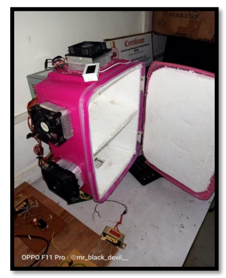
Fig.Fig.3Experimental set upFig. aActual model of experimental set up