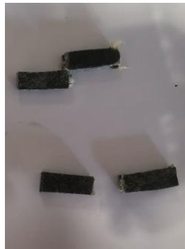
Fig 5.4 Kevlar carbon L rubber after impact

It is seen that the composite high hardness rubber did not break during impact test and the composite with low hardness rubber breaks and the other almost breaks during the impact test.