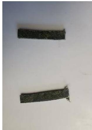
Fig 5.1 Kevlar carbon H rubber before impact

The impact strength of the composite material are as follows. The impact strength of the composite is expressed in \frac{KN}{m^2}