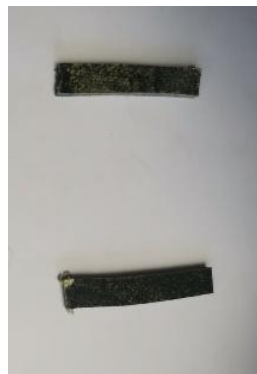
Fig 5.3 Kevlar carbon L rubber before impact