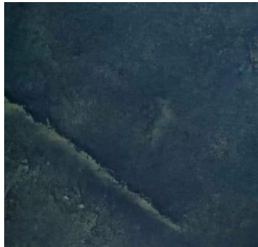
Fig 4.1 kevlar carbon low hardeness rubber

The Kevlar Carbon are cut into pieces of dimensions 150*300 mm and the rubber is powdered. The epoxy resin is mixed with hardener and catalyst in the ratio 3:1. Then the Kevlar carbon rubber are made into layers with epoxy resin and kept inside the vacuum bag. And the composite is prepared by compressing or removing the air inside it.