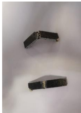
Fig 5.2 Kevlar carbon H rubber after impact