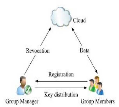
Fig. 1. System model

We consider a cloud computing architecture by combining with an example that a company uses a cloud to enable its staffs in the same group or department to share files. The system model consists of three different entities: the cloud, a group manager (i.e., the company manager), and a large number of group members (i.e., the staffs) as illustrated in Fig. 1.