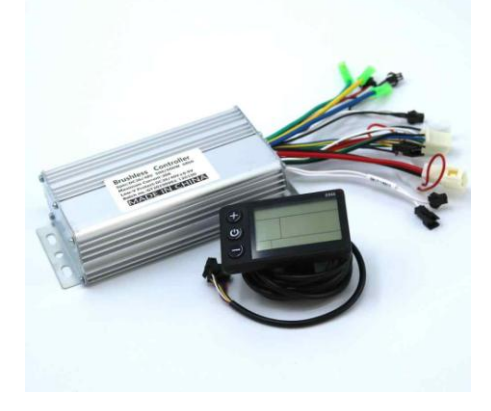
Fig 2 Controller

A motor controller is a device or group of devices that serves to govern in some predetermined manner the performance of an electric motor. A motor controller might include a manual or automatic means for starting and stopping the motor, selecting forward or reverse rotation, selecting and regulating the speed, regulating or limiting the torque, and protecting against overloads and electrical faults.