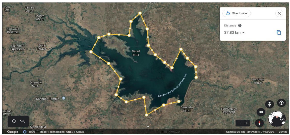
Bembla Dam -shows 23 birding spots which covers 37.83 km area.

The study was undertaken in Bembla spillway and Reservoir located on the bank of the river Bembla river in Yavatmal district, Maharashtra state, India. Bembla western part between _____ 20.60'N latitude and 78.12'E and the eastern part between 20.61'N latitude to 78.12' E longitude. Reservoir covers an area of 53000 hectares which was given a big opportunities to an Ornithologist who use to visit the area for his study and research on birds. The Bembla dam is surrounded by village Koli in north, SH 15 in east and open agriculture land in west and Pahur at south direction. Study area including 23 stations and total 37.83 km area surveyed for diversity of birds.(Fig-1) The bird species survey was conducted every fourth day in early morning from 6.00 am to 9.30 am and on every Saturday and Sunday from 6.30 am to 10.30 am . The species of birds were observed by using . Binocular Nikon 10*50 X, was used for close observation of birds and for photography Nikon D7500 camera, with Lens 200-500 mm. Book of Indian Birds by Salim Ali and Birds of the Indian Subcontinent by Grimmett, Inskipp and Inskipp were used as field guides and for preparing check list.