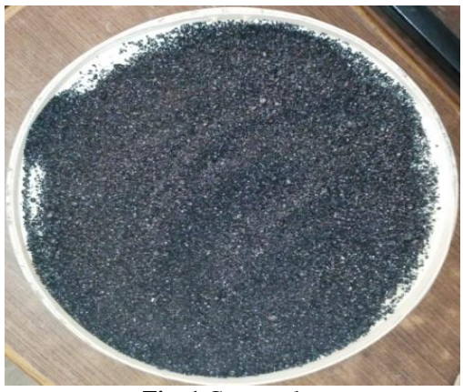
Fig. 1 Copper slag

Copper slag is a by-product material produced from the process of manufacturing copper. As the copper settles down in the smelter, it has a higher density, impurities stay in the top layer and then are transported to a water basin with a low temperature for solidification. The final product is a solid, hard material that goes to the crusher for next processing. Copper slag is an irregular, black, glassy and granular in nature and its properties are similar to the river sand. Copper slag used in this work was brought from Sundara Enterprises (zone-II), a dealer in Bhosari MIDC area, Pune. The nature of copper slag used in experimental work shown in fig. 1. The physical and chemical properties of Copper slag are shown in table 3 and table 4.