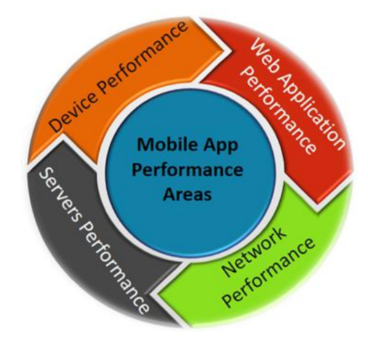
Fig.1. Four main target areas of Mobile application Performance Testing Framework