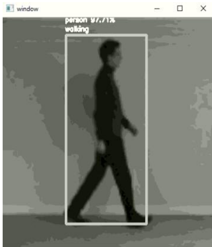
Figure -2: Labelled activity recognized Person walking

The project is a python implementation. The Python program is run from the Idle IDE. There are different acts in the videos. First, video is collected from the directory, and then processed where the background containing the unwanted images is removed, and then processing steps are taken to identify activity only by people being moved for activity recognition.