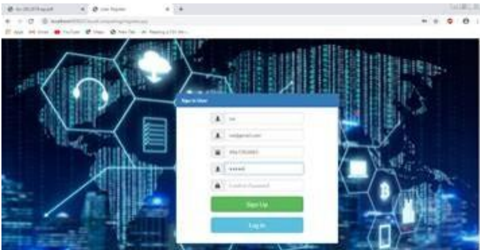
Fig 3: User Register Form