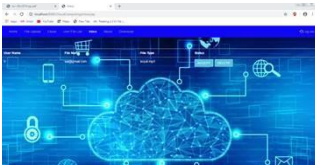
Fig 7: Cloud Storage