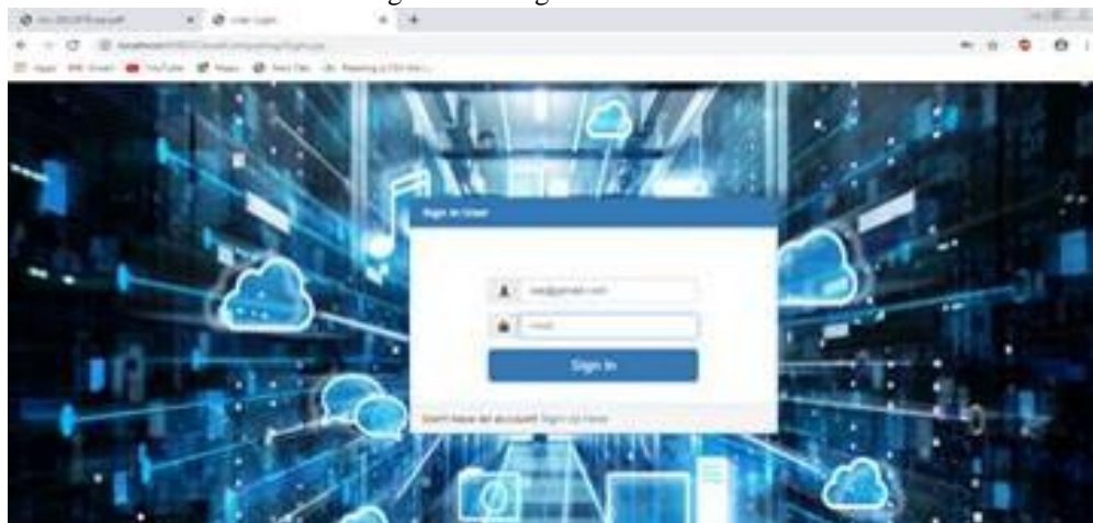
Fig 4: Login Form