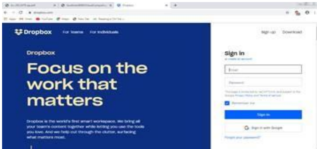
Fig 5: Data Request