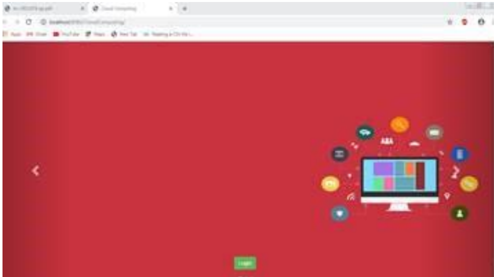
Fig 2: User Interface Diagram