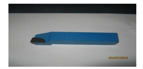
Figure 3: Cutting Tool