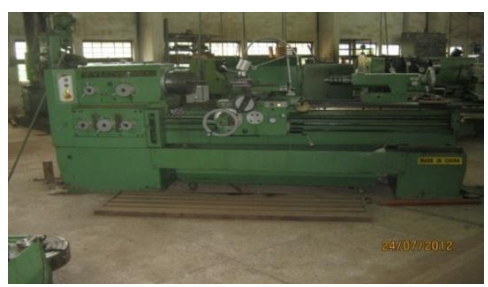
Figure 2: Lathe machine