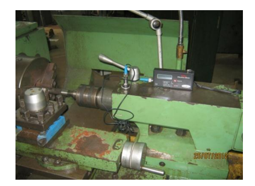
Figure 5: Set-Up for the Measurement of Induced Vibration