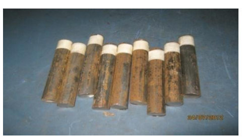
Figure 1: Work-Piece Material

The following Materials and equipment are used to perform the experiment; Work-piece type 41Cr4 alloy steel round bar of 25\emptyset \times 150 mm with the following specifications; (UTS = 902.83 N/mmm<sup>2</sup>, BHN = 278.55 and chemical composition of 0.4%C, 0.25 S, 0.65 Mn, 1.0 Cr) (Fig 1); conventional lathe Machine (Fig 2) with carbide (F30 Type) cutting tool (Fig 3) of dimension (25x25x12.5mm) type (HSS-718) with the following angles; back and side rake angle is 10^{\circ} , 12^{\circ} respectively, side relief angle is 5^{\circ} and side cutting edge angle is 15^{\circ} using the stardard angle given in Jaton N.W[11].