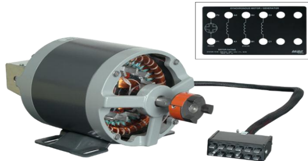
Figure:3 Synchronous Generator