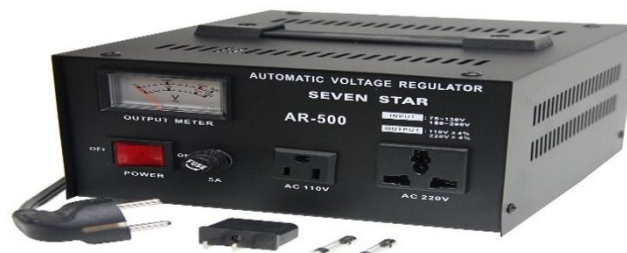
Figure:4 Automatic Voltage Regulator