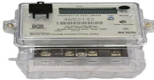
Figure:6 Bi-directional Meter

g) SCADA: The components required for the reliable operation of the overall system are system control and monitoring, the energy management system (EMS), and system thermal management. System control and monitoring is general (IT) monitoring, which is partly combined into the overall supervisory control and data acquisition (SCADA) system. It also provides real-time data and real-time fault analysis. By using PLC and SCADA we can control the operation of windmills which are located in remote locations.