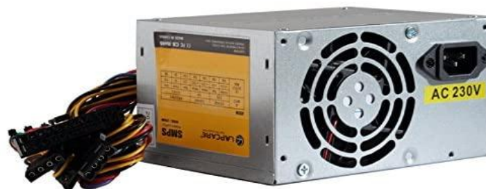
Figure:5 Switch Mode Power Supply