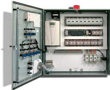
Figure:7 SCADA Panel And PLC

g) SCADA: The components required for the reliable operation of the overall system are system control and monitoring, the energy management system (EMS), and system thermal management. System control and monitoring is general (IT) monitoring, which is partly combined into the overall supervisory control and data acquisition (SCADA) system. It also provides real-time data and real-time fault analysis. By using PLC and SCADA we can control the operation of windmills which are located in remote locations.