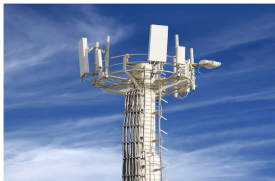
Figure:8 Mobile Tower

h) LOAD (MOBILE TOWER): In our project, a mobile tower acts like a load, where we give the generated energy to this load. It requires both AC and DC current. AC supply is required for auxiliary equipment like light, air conditioning, and other applications. Where DC supply is used to operate the mobile tower radiation plates and its connected devices. This equipment works on plus and minus 24 volts for one operator. It requires 60Amp current. It requires a continuous supply without distraction and minimum switching.