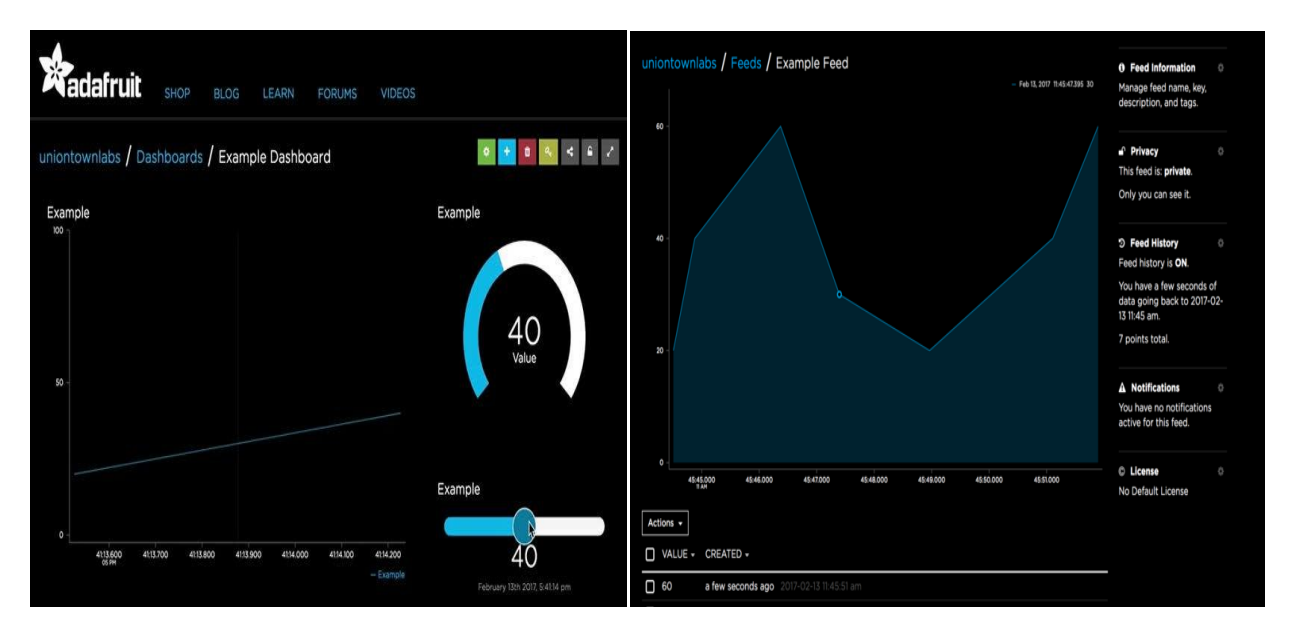
Figure.3: Data visualization and data