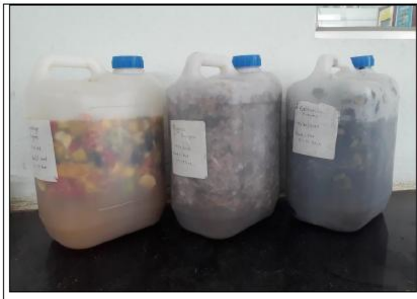
Figure 3: Containers used to Store the Material for Preparation of Garbage Enzymes