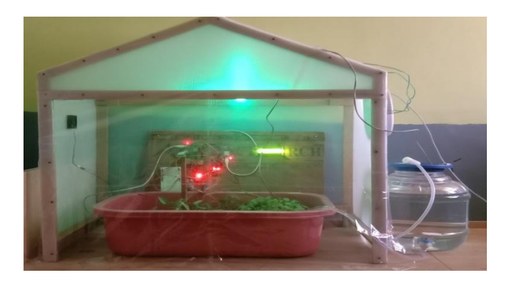
Figure 2 : Prototype of greenhouse

The Greenhouse which has implemented it consist of a particular climatic conditions for the optimum growth of plants. During morning the heat will be received from sunlight, it there is a excess of heat the cooling fan will be used in order to cool the temperature and an irrigation system is used for the optimum use of water for the growth of plants.