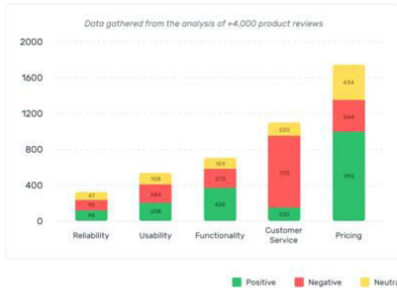
Fig 3. Data gathered from the analysis of product reviews

The accuracy value represents the percentage of test texts which were classified correctly by the model. In this we have used two approaches, the first approach is using the “Naive Bayes (NB)” method and the other approach using the “Support Vector Machine (SVM)”.