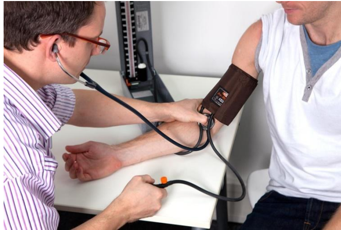
Figure .01 BeforeMuda Elimination

In the second figure, fig 02, a simple device is there by which patient herself is measuring blood pressure by just a single machine by one press only.