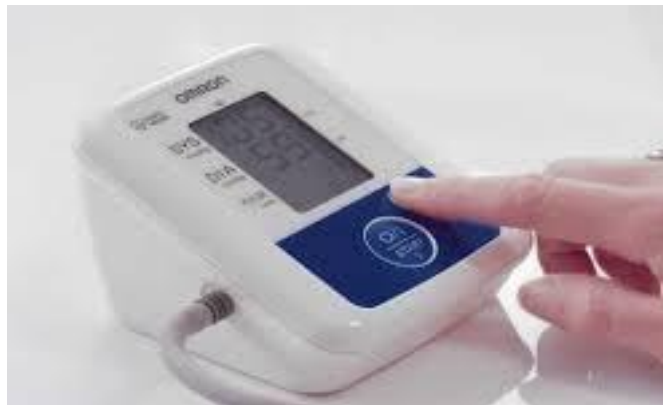
Figure.02 AfterMuda Elimination

In the second figure, fig 02, a simple device is there by which patient herself is measuring blood pressure by just a single machine by one press only.