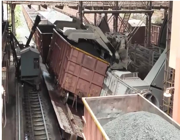
Figure .03 Wagon Tippler

and company is not able to use this man power in this period. So we have the problem to how to minimize this unloading time and use labor perfectly so that loss of revenue can be optimize.