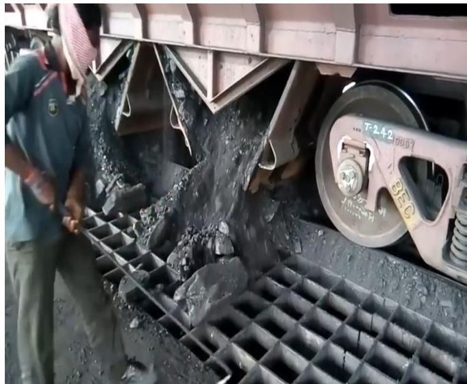
Figure .05 Square mash