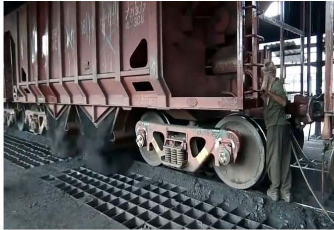
Figure .04 Track Hopper opening