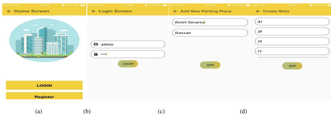
Figure.1 shows the Admin side functionalities like (a) shows the Home Page. (b) it shows the Admin login page. (c) it shows Adding New Parking Place. (d) it shows the create the slot by the Admin.