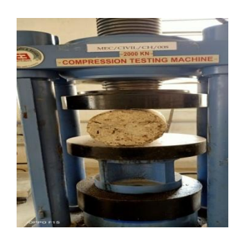
Table.7: Testing Results

The split tensile strength test obtained from 28 daysof curing in water.