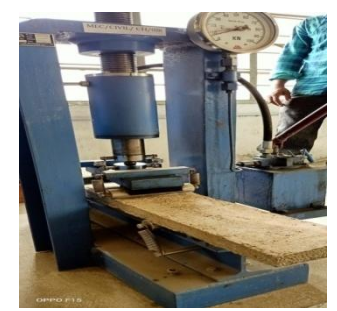
Fig. 4: Testing on beam

Flexural strength: The flexural strength test is conducted on the beam and results are shown in the table 8.